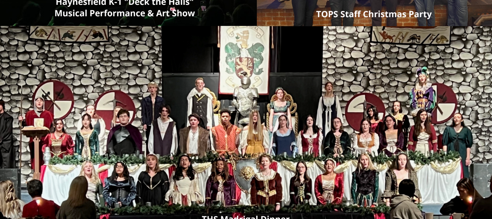
THS Madrigal Dinner