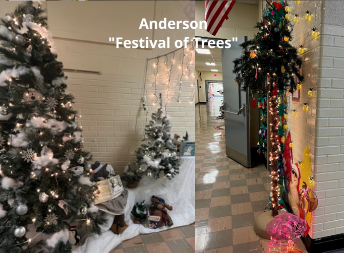
Anderson "Festival of Trees"