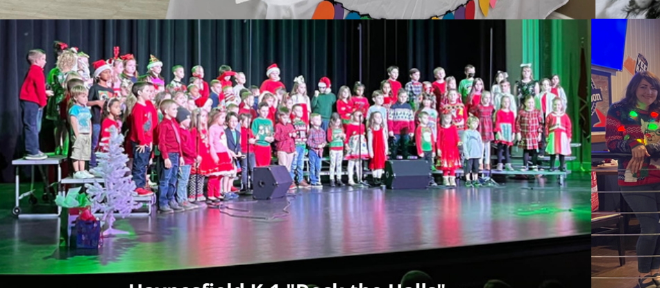
Haynesfield K-1 "Deck the Halls" Musical Performance & Art Show