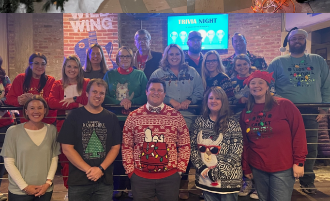
TOPS Staff Christmas Party