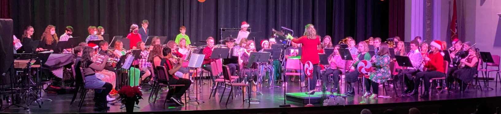
TMS & THS Winter Band Concert (6th Grade Band)